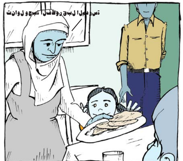
...to a wintery North American city. My family's life has changed quickly.