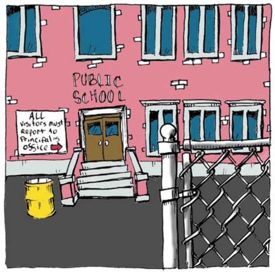
....I learned what power looks like.