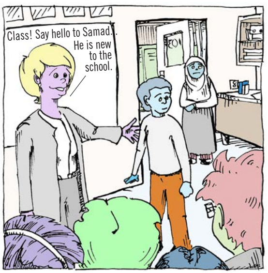
...I will have to be very careful...